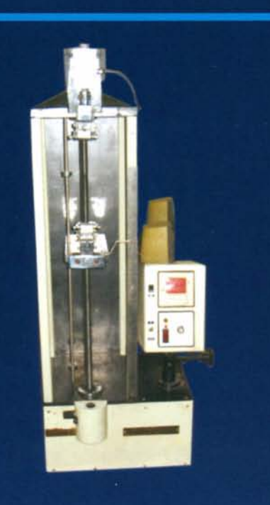
Tensile & Elongation Testing Machine