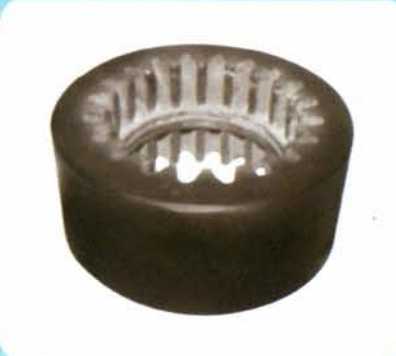
Internal Teeth Gear Coupling Pad