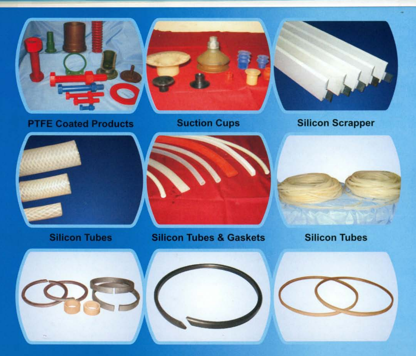
Pure & Graphited / Glass / Bronze / Mos, / Carbon Filled PTFE Gland Seals, Piston Seals, Piston Rings, Guide Rings & Bushing