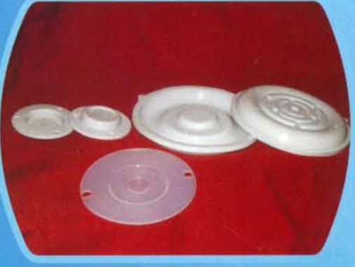
Silicon Rubber Diaphragms

High Temperature Silicon Diaphragm for Bag Flush System