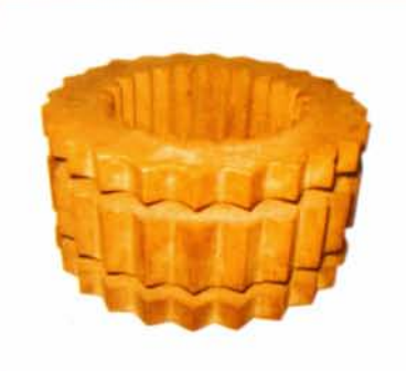
Internal & External Teeth Gear Coupling Pad