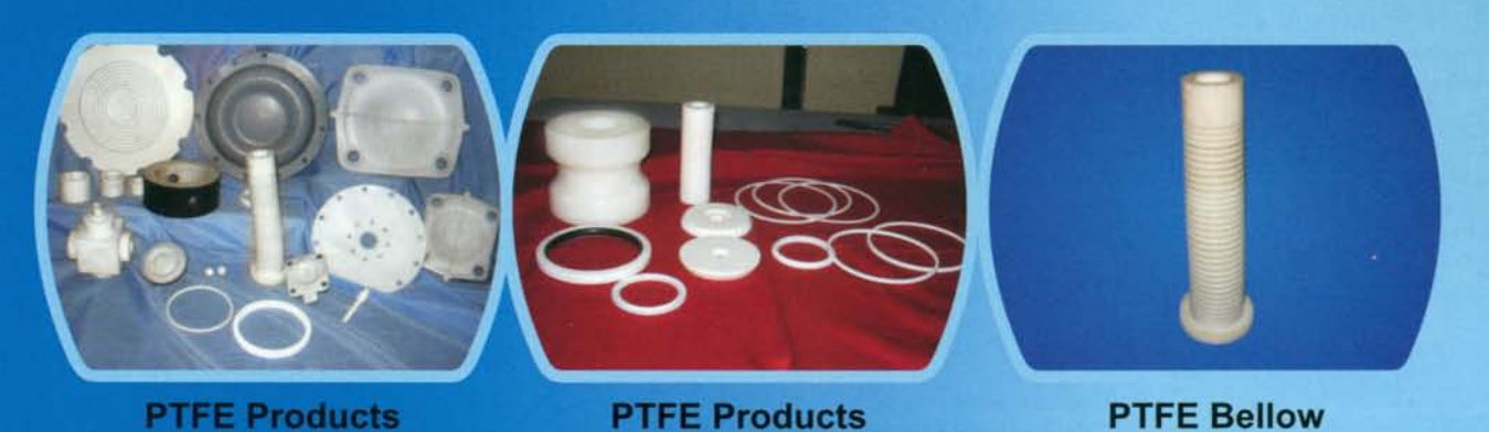
PTFE Coated Fasteners and equipments for Anti Corrosion & Non Stick Purpose