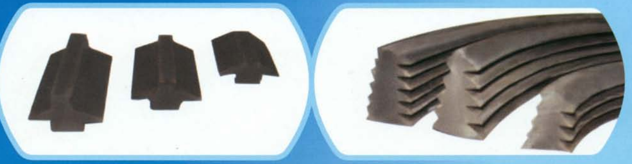
Stoppers Reka Gaskets for GRP & FRP Pipes Reka Ring Gasket & Stoppers for GRP & FRP Pipe in EPDM & SBR Rubber for size of 100 NB To 2500 NB Sealing & Lid Gaskets for Autoclave Ovens and Filters