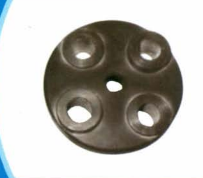
Disc Coupling Pad