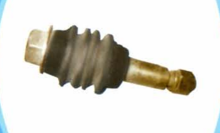
Coupling Bush & Bolt

Coupling Pads of Various Sizes & Shapes to Reduce Vibration and Transfer Torque