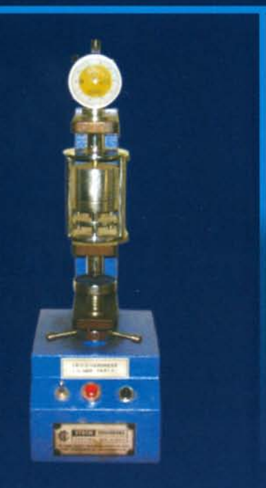
International Rubber Hardness Tester Compression Set Testing M/C